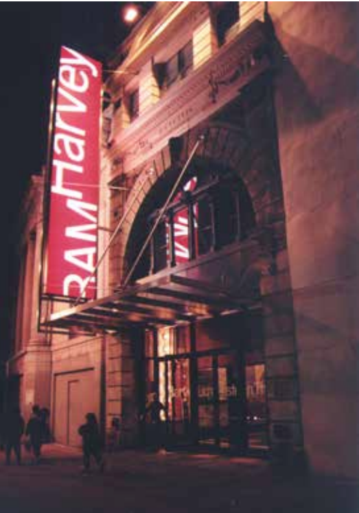
BAM Harvey Theater | Photo: Elena Olivo