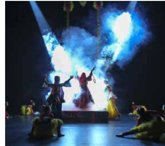
DanceAfrica