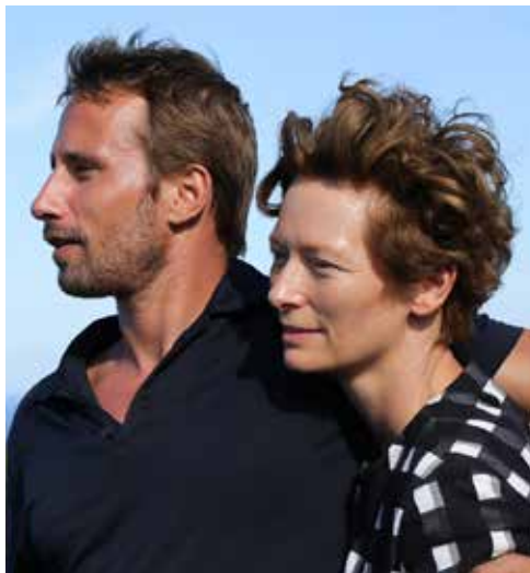
A Bigger Splash | Photo courtesy of Fox Searchlight Pictures