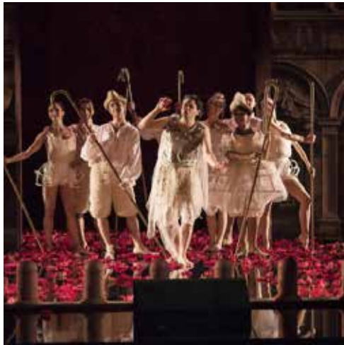
Les Fêtes Vénitiennes