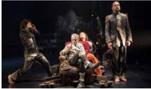
Tabac Rouge