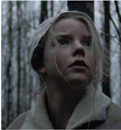
The Witch