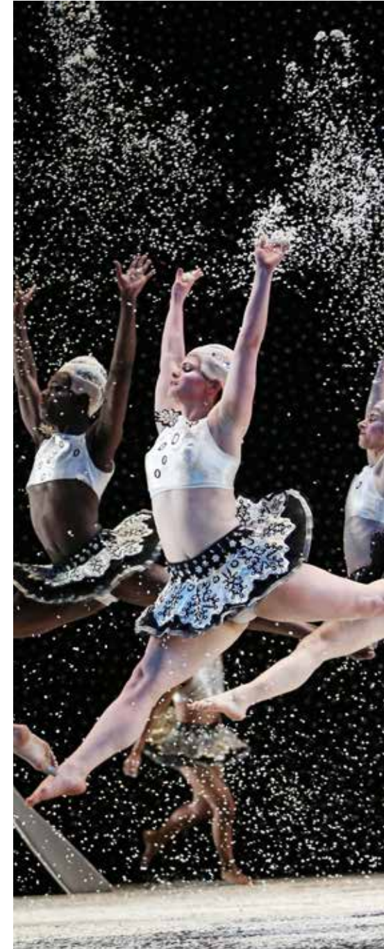
The Hard Nut