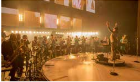
Real Enemies | Photo: Ed Lefkowitz