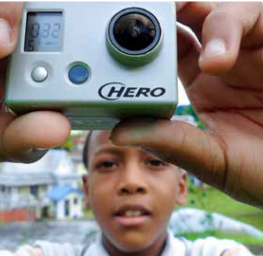
Art Connect | Caribbean Film Series