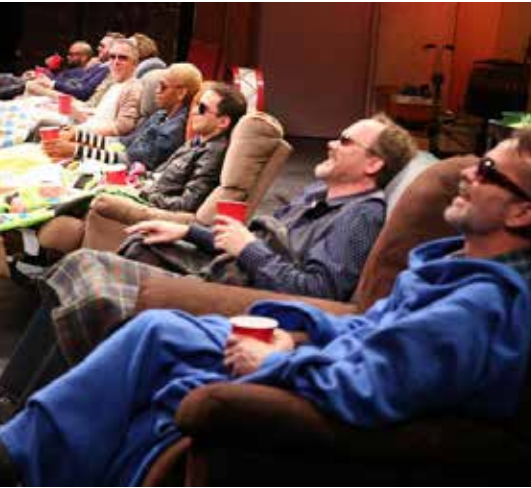
The Glory of the World