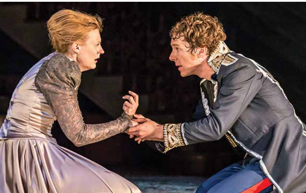
Anastasia Hille and Benedict Cumberbatch in Hamlet