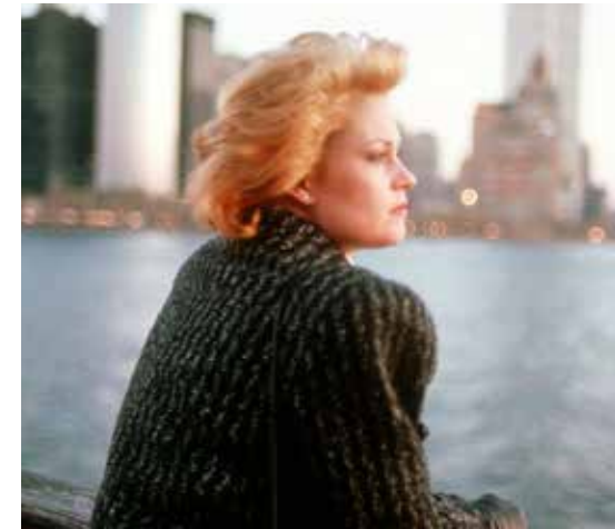
Working Girl | Interesting Women, Interesting Lives