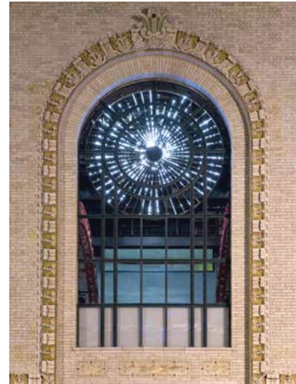
Stars by Leo Villareal, BAM Howard Gilman Opera House

THE COUNTRY'S OLDEST PERFORMING ARTS INSTITUTION DYNAMICALLY LEADS THE BROOKLYN CULTURAL DISTRICT