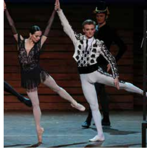
Mariinsky Ballet in A Tribute to Maya Plisetskaya