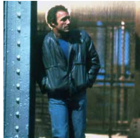
Thief | Heat & Vice: The Films of Michael Mann