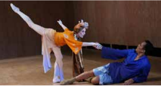
Hagoromo | Photo: Julieta Cervantes