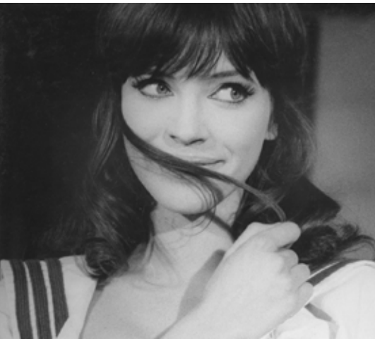
A Woman Is a Woman | An Evening with Anna Karina