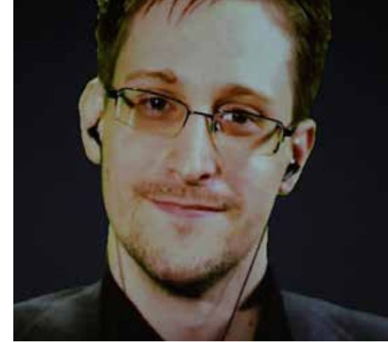
Edward Snowden