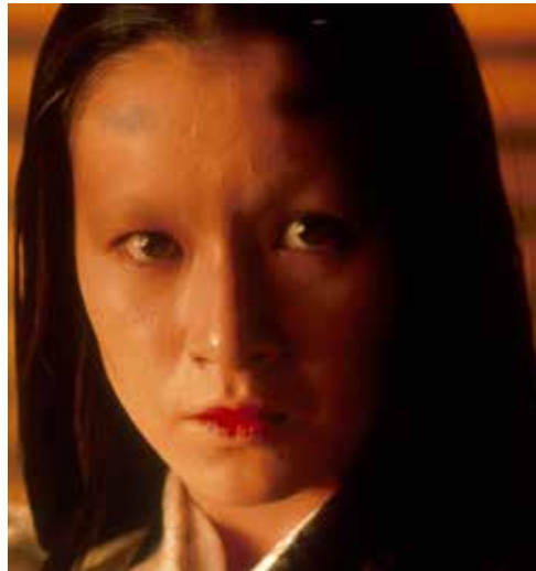
Ran | Around the World in 5 Restorations | Photo courtesy of Orion Classics/Photofest