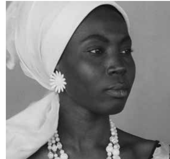
Black Girl