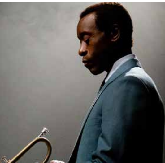
Miles Ahead