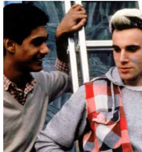
My Beautiful Laundrette | Labour of Love: 100 Years of Movie Dates