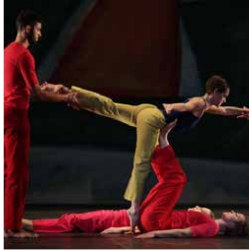
Trisha Brown Dance Company