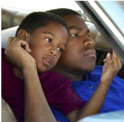
Imperial Dreams | New Voices in Black Cinema