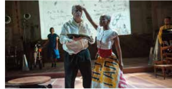
Refuse the Hour