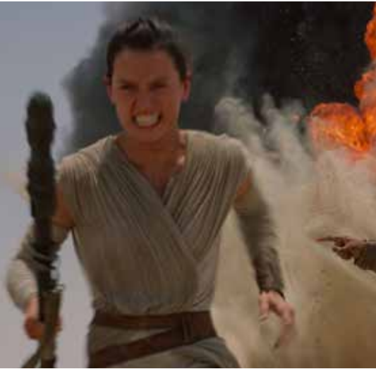
Star Wars Episode VII: The Force Awakens 3D