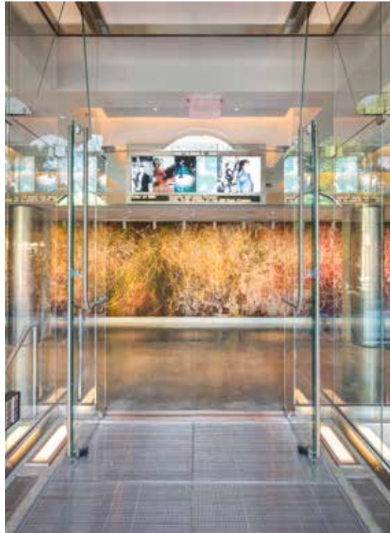
Fisher Building