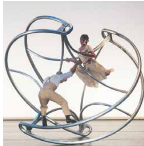
La Verità