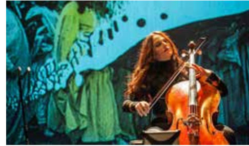
All Vows